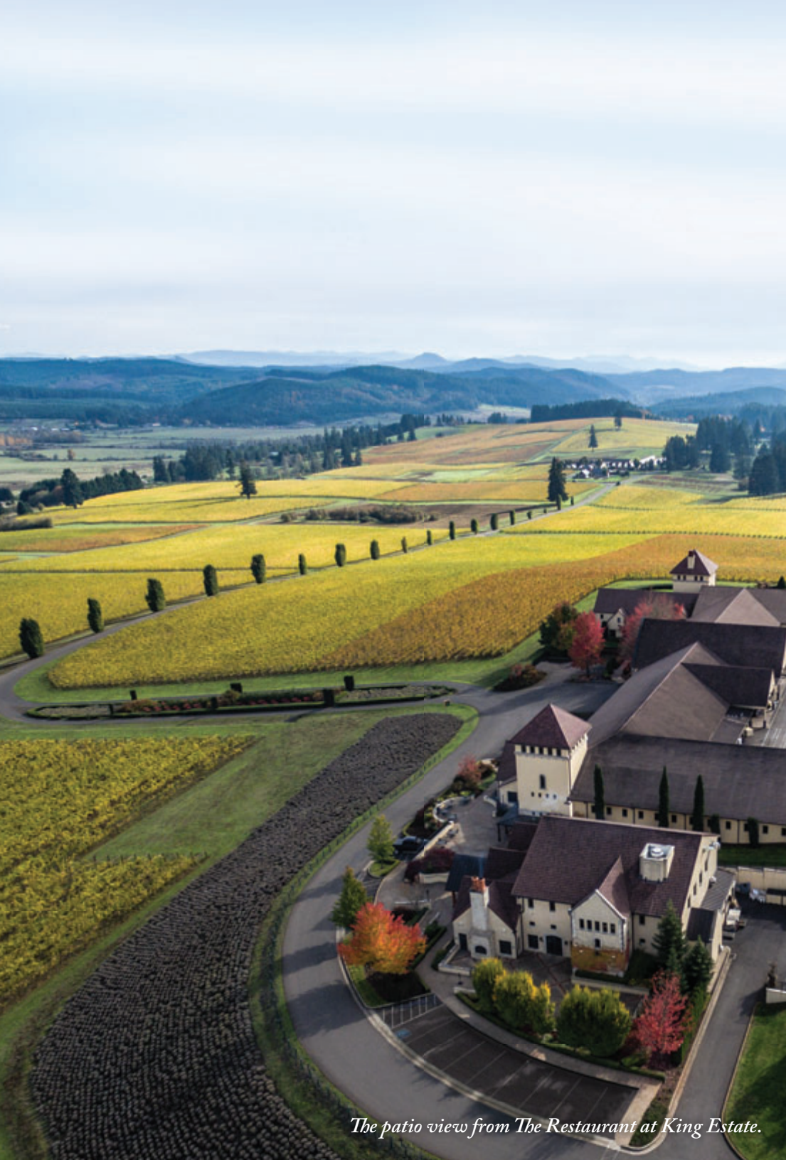
The patio view from The Restaurant at King Estate.